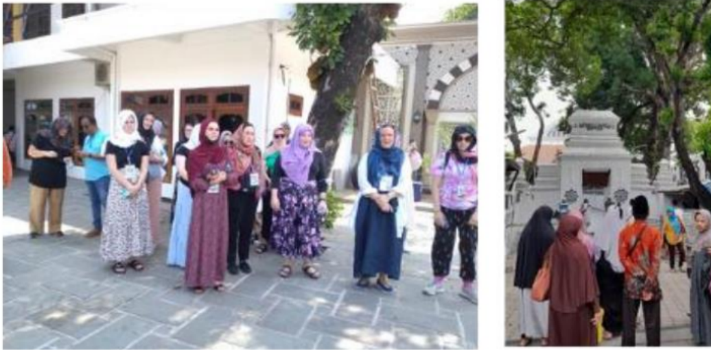
Figure 1. Muslim and non-Muslim tourists visit the tomb of Sunan Ampel

2 religious tourism to contribute to local development and are implementing measures to support and promote this sector (Arinaitwe et al., 2017).