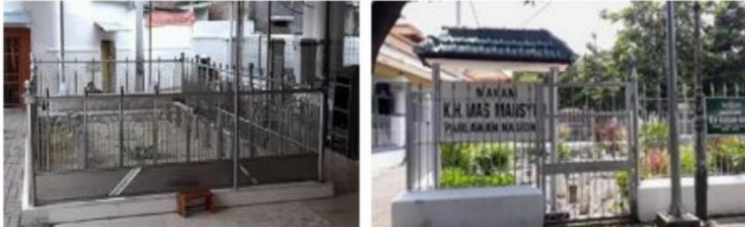
Figure 3. Stunning view of the Sunan Ampel burial complex

In Islamic tradition, visiting graves is considered a way to remember death and to reflect on the transient nature of life. This can have a profound psychological and spiritual impact on individuals, helping them to find a sense of peace and perspective in the face of life's challenges (Wahyudie et al., 2021).