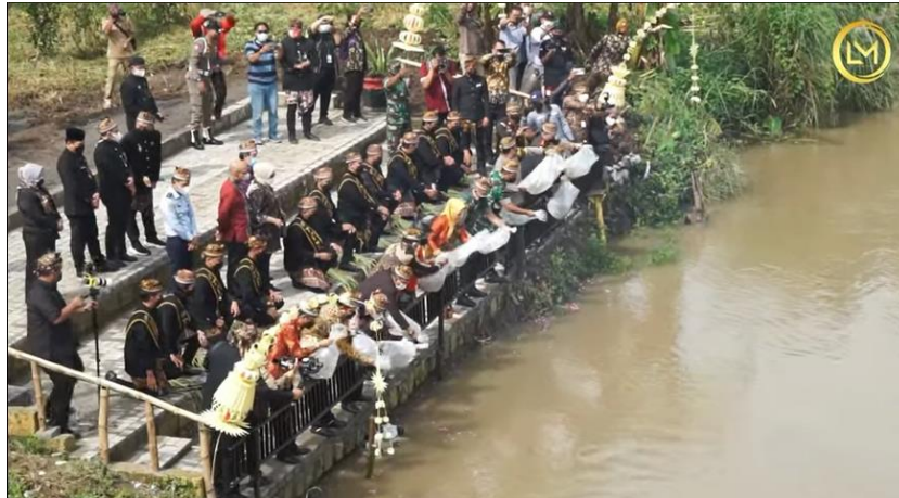
Figure 2. Umbul Dungo “Majatirta Festival” 2022

Source: https://www.youtube.com/watch?v=c5xZl-v1fZU