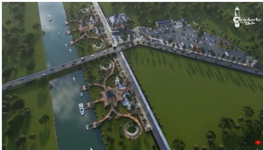
Figure 3. Mojopahit Marine Tourism Development Plan

According to the primary survey, roughly 69% of respondents were aware that the development plan of Mojopahit Marine Tourism would be developed using the water tourism concept. Along the Ngotok River, numerous tourist facilities will be constructed, including agrotourism, cultural parks, amphitheaters with capacities for 100 people, food courts, paddle boats, Mojopahit ship designs, and others. The Mojopahit Marine Tourism development plan was supported by 98% of respondents, who responded favorably and fully pay their attention to here.