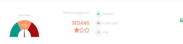
Analisis Pengaruh Pademic Covid 19 Terhadap Proses Import Bahan Pembantu dan Baku Kopi.docx

The condition of the import process of PT. During covid 19, 2019, Santos Jaya Abadi imported 1113 containers of coffee supplies and raw materials. At the beginning of the pandemic in 2020, coffee imports decreased to 817 containers by the end of the year. It has decreased significantly during the Covid-19 outbreak. And from 2021 until May, coffee imports began to increase with 315 containers, almost 500 containers in 5 months.