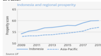
Fig. 2 The number of Indonesian Prosperity

They sell or delivering newspapers every morning. They sell snacks after or before schools. They sell plastic bags at the traditional market or became a porter, helping any women who needed help carrying their luggage to public transport in front of the market. Some of them even go for helping their parents as a beggar on the street. That's really horrible situation of the haven't. Those conditions of the haven't family and their kids, making money in so many ways no matter what, they only have their spirits and their energy to stay alive by doing that. They have no cash to start their own business, but their energy, their effort, their spirit to get profit as much as they could sometimes make their wheel off their life turned around.