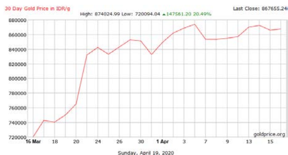
Graph 1. World crude gold price